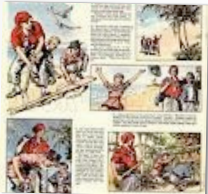
WHAT IS IT ABOUT?