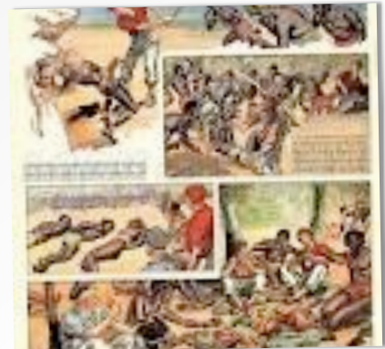
HOW IS IT SIMILAR TO LOF?