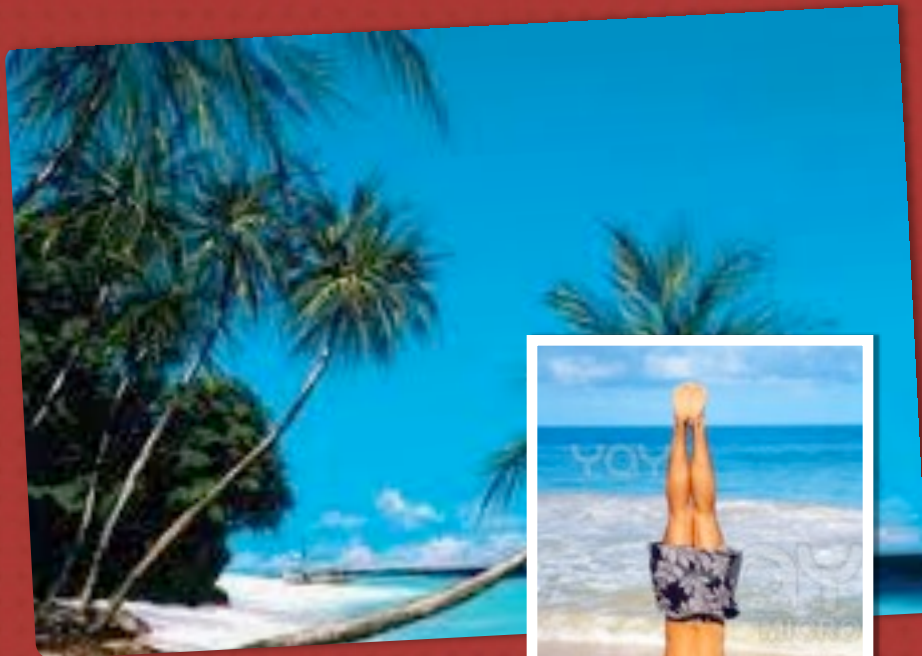
THE BOYS ON THE BEACH